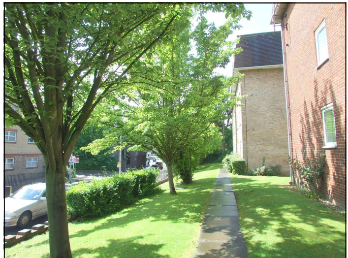
“The owner of this property is an employee of Frost Estate Agent”